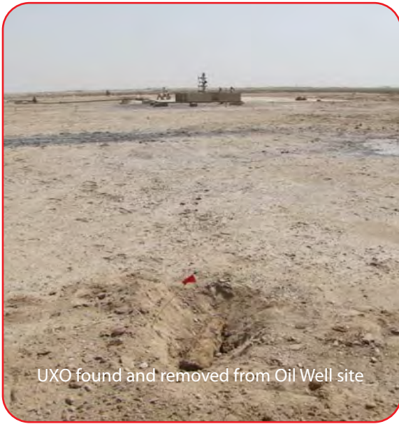
UXO found and removed from Oil Well site

At Al Khebra Al Fania we use top of the line and the most efficient equipment in the field of Mine field and UXO clearing, such as: