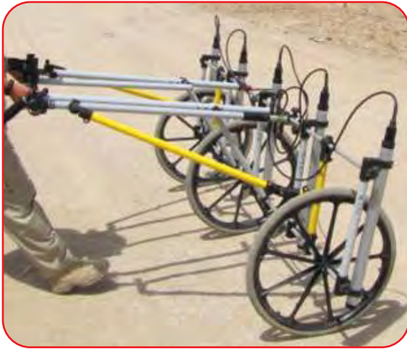
Ebinger Magnex 120 LW 5 Channel system