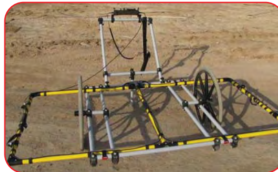
UPEX 740 L Large Loop detector cart

Our qualified crew will save no effort to provide the safest and the most cost effective solution for our clients who are looking for the best results in the shortest time frame.